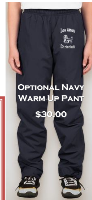
OPTIONAL NAVY WARM-UP PANT $30.00

Our 15-16 P.E. uniform style is still acceptable to wear for the 16-17 school year. We will clearance out our current inventory of last years style. You may stop by the office and purchase the old style uniforms from 9:00-3:00 p.m. August 8-12. Your FACTS account will be charged for any P.E. uniforms purchased. Clothing will be sold first come, first served until our inventory is gone.