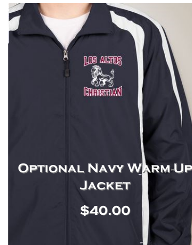
OPTIONAL NAVY WARM-UP JACKET $40.00