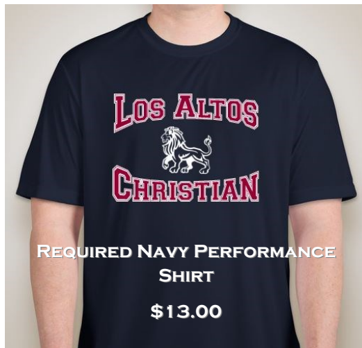
REQUIRED NAVY PERFORMANCE SHIRT $13.00