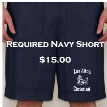
REQUIRED NAVY SHORT $15.00