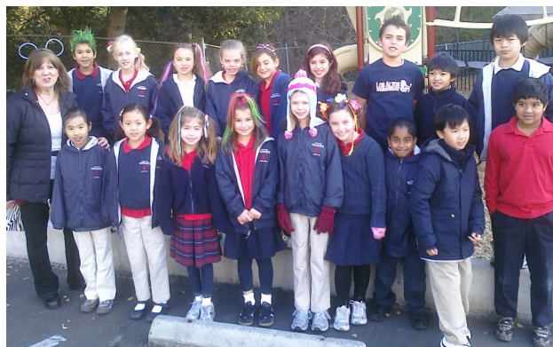
Third Grade lookin' sharp!