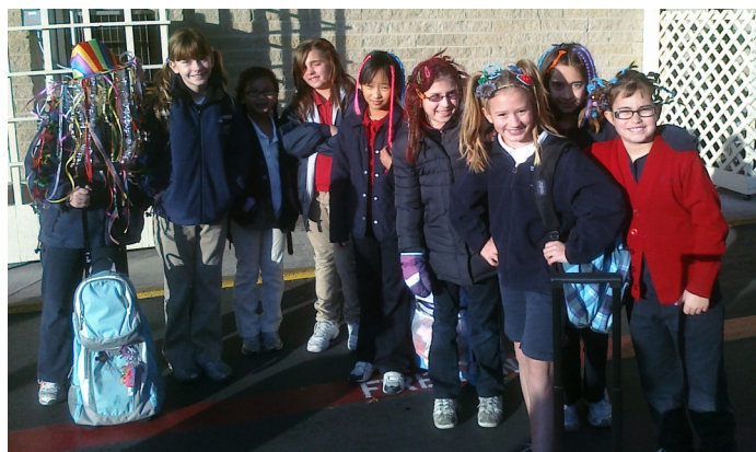
Fourth Grade Girls Strike a pose!